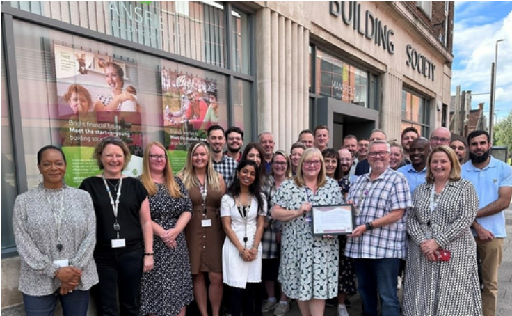
Mansfield Building Society

Carer Friendly Employer Quality Marks have been presented to: