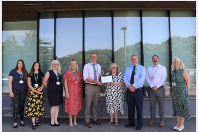
Ashfield District Council